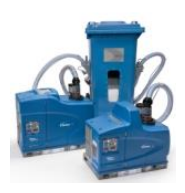
Nordson Liberty® has given Beardow Adams the permission to use this image.