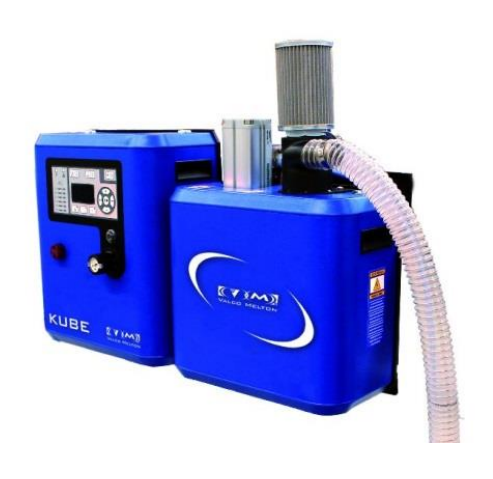
Valco Melton Kube® has given Beardow Adams permission to use this image.