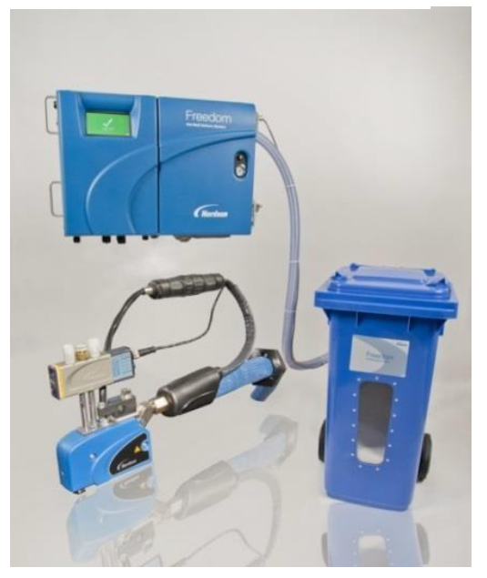
Nordson® Freedom Complete System has given Beardow Adams permission to use this image.